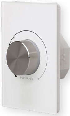
DGDALIDM for on/off switching and dimming control