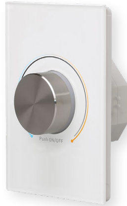
DGDALIDM8 for on/off switching, dimming and colour temperature control